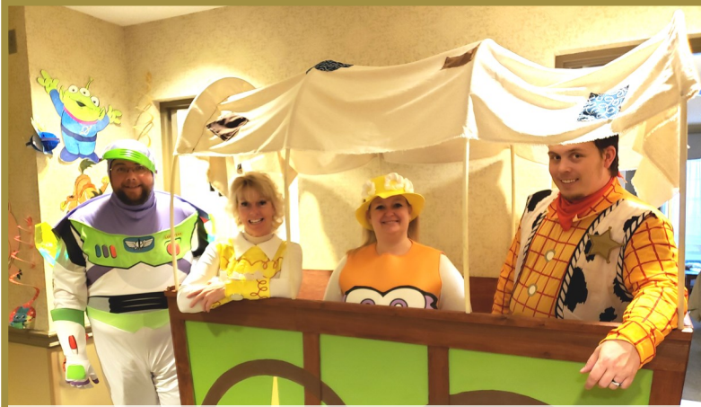
Our Accounting Department handed out treats at the 16th Annual Trail of Treats at the Country Cupboard. Learn more about this event at www.wnep.com .