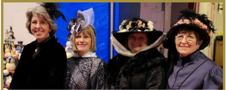
We were happy to again sponsor the Bellefonte Victorian Christmas. Learn more about this fun-filled, annual event here:

More information can be found to the right. >>>