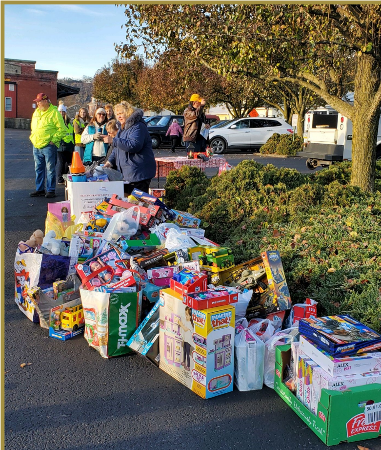
Toys pile up for our 16th Annual Toys for Tots Drive, at our home office in Northumberland, PA.

More information can be found to the right. >>>